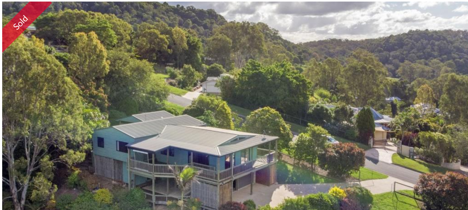
20 Brosnahan Court, Belivah